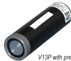
V13P with pressure sensor

For research requiring temperature and depth information, V13 tags can be equipped with temperature, V13T, or depth, V13P, or both temperature and depth sensors, V13TP. V13P pressure transmitters are available in the following full scale pressure options: 17, 34, 68, 136, 204, 340, and 680 meters. V13T temperature transmitters are available in four temperature ranges: -5 to 35°C, -4 to 20°C, 0 to 40°C and 10 to 40°C.