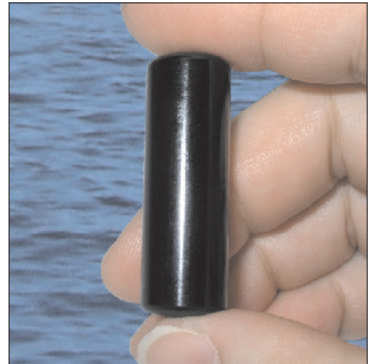
The V13 transmitter

Stated tag length, weight and output power are nominal. Small manufacturing variations can be expected.