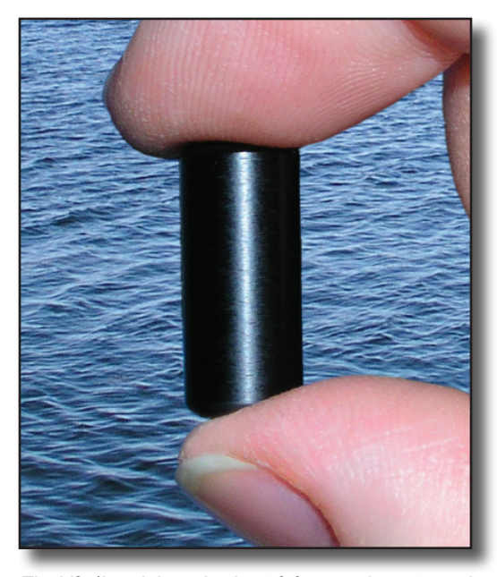
The V8-4L weighs only about 0.9 grams in water and is only 20.5 mm long.

Stated tag lengths are nominal. Small manufacturing variations can be expected.