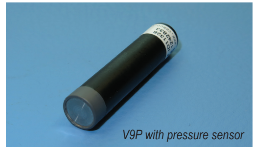
V9P with pressure sensor

Coded V9 tags are available at 69.0 kHz.